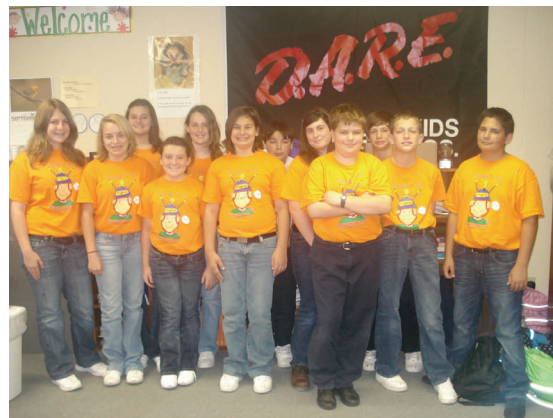
7th Graders wearing this year's JKAA Shirt.